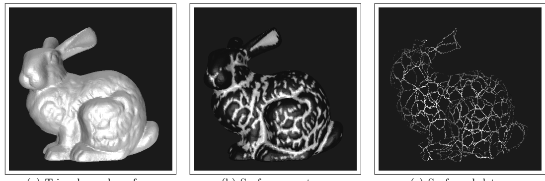
(a) Triangle mesh surface.