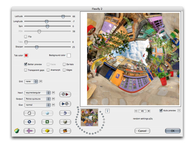
Figure 9: Screenshot of Flexify's graphical user interface

Despite these issues the software is quite simple to use. The user loads an image into Photoshop, starts Flexify, and through pop-up menus describes the input image supplied and can cycle through the different output projections with the help of a low resolution preview. Sliders tumble the image sphere, letting the user rapidly evaluate various options and discover the projection which flatters the photograph best. Figure 9 shows Flexify in action.