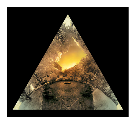
Figure 8: St Dustan. Spherical panorama projected using the Lee Tetrahedric Map projection.

take several minutes on a current 2 GHz consumer PC. This can be greatly accelerated by breaking up the output polygon into triangles whose barycentric coordinates are used as indices into a lookup table calculated offline. In practice, coarse tables of about 50x50 entries, linearly interpolated, reduce render times from minutes to seconds with no perceptible loss of image quality. High-quality resampling is achieved through the Feline algorithm [MRPaJ99] and sinc filtering [Tur90].