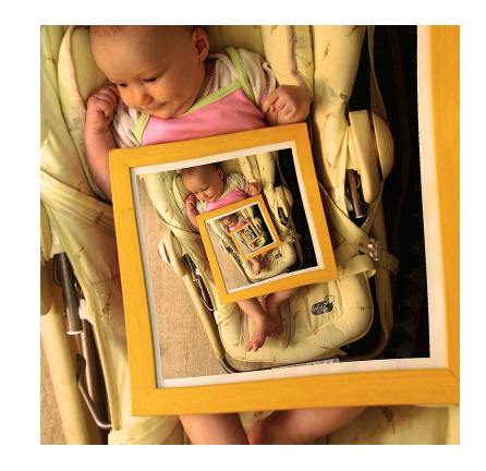
Figure 1: Honey, I Escherized the Kids! Image created using the Droste effect . © Sébastien Pérez-Duarte, used with permission.