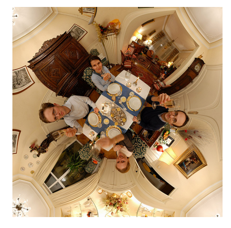
Figure 3: Peirce Quincuncial Projection.

It is also possible to conformally represent the whole sphere into an hemisphere, and this hemisphere can be projected as a circle by a stereographic projection (Lagrange projection). This circle can then be transformed into a square thanks to Schwarz's formula (Adams World in a Square). It is also possible to independently project each hemisphere into a disk and square this disk (Peirce quincuncial mapping and Guyou Doubly Periodic map—see figures 3 and 4).