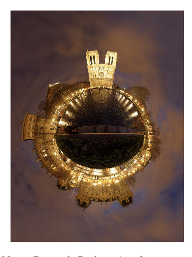
Figure 5: Notre-Dame de Paris, using the stereographic projection where the plane of projection is at the nadir, and the point of projection at the zenith.

or, if you switch the two poles, that have a tunnel feeling as in figure 6. In any case the center of the projection is never seen, because it would be projected on the plane to the infinite (in all directions).