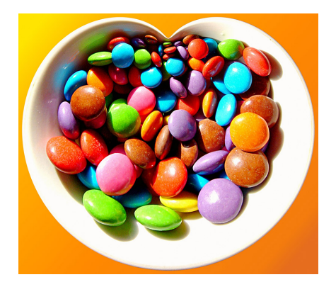
Figure 2: Smarties: Heart Mapping. Applying the conformal mapping f(z) = z^2 + 2z ; the plate was transformed from a circle to a heart, while preserving the shape of the smarties. (©Alexandre Duret-Lutz, used with permission.

unit circle s into any polygon w of n sides [Lee76]: