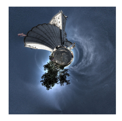
Figure 7: Planet Grain Mill, using an oblique stereographic projection. Many of the vertical lines appear curved.

When rotating the sphere, the center of the plane will no longer be located at a pole (the zenith, or the nadir). This means that vertical lines of the original scenery are no longer preserved. Off centering the projection a bit can give a jelly look to buildings, as in figure 7. It is also an option when both poles should be shown.