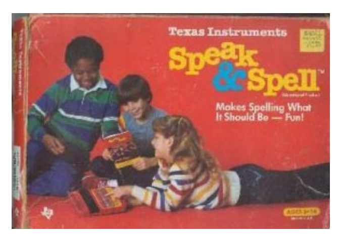
video 'Speak and Spell commercial (circa 1980).mp4'