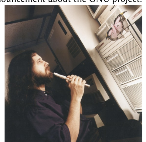
taming a butterfly